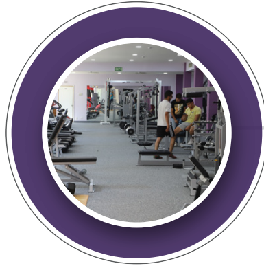
Athletics & Gymnasium Facility