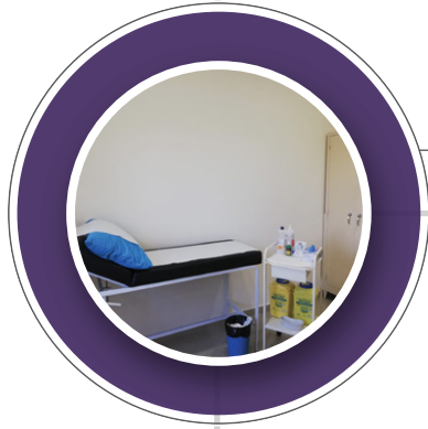
Health & Wellness Services