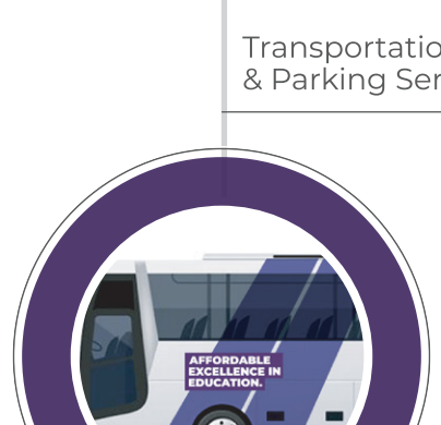
Transportation & Parking Services