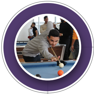
Student Center & Lounge