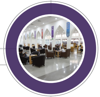
Library & Bookstore