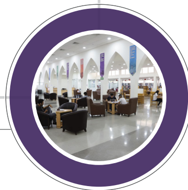
Library & Bookstore