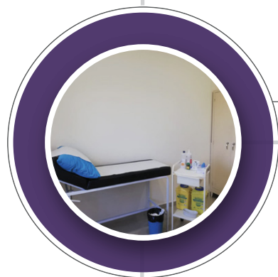
Health & Wellness Services