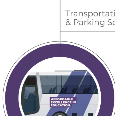
Transportation & Parking Services