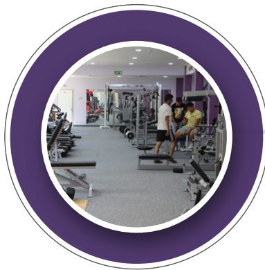
Athletics & Gymnasium Facility