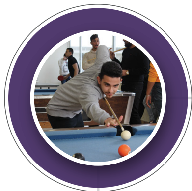
Student Center & Lounge